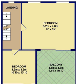
1ST FLOOR APPROX. FLOOR AREA 43.1 SQ.M. (464 SQ.FT.)