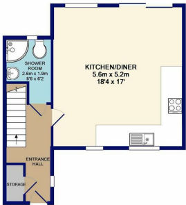
GROUND FLOOR APPROX. FLOOR AREA 41.1 SQ.M. (442 SQ.FT.)